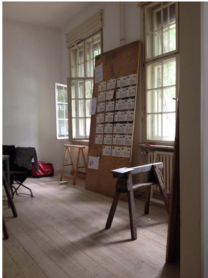
KBB workspace at Glogau Air